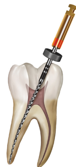
DCTaper file is designed for dentin conservation

DCTaper rotary files feature a parabolic cross-section design that combines high efficiency and flexibility, while being safe and resistant to fracture. When establishing canal patency, the DCTaper rotary files are ideally preceded by DC Glide Path 2 files. Used together, the DC Rotary File System adds precision to root canal procedures while saving chair time and reducing stress for clinician and patient.